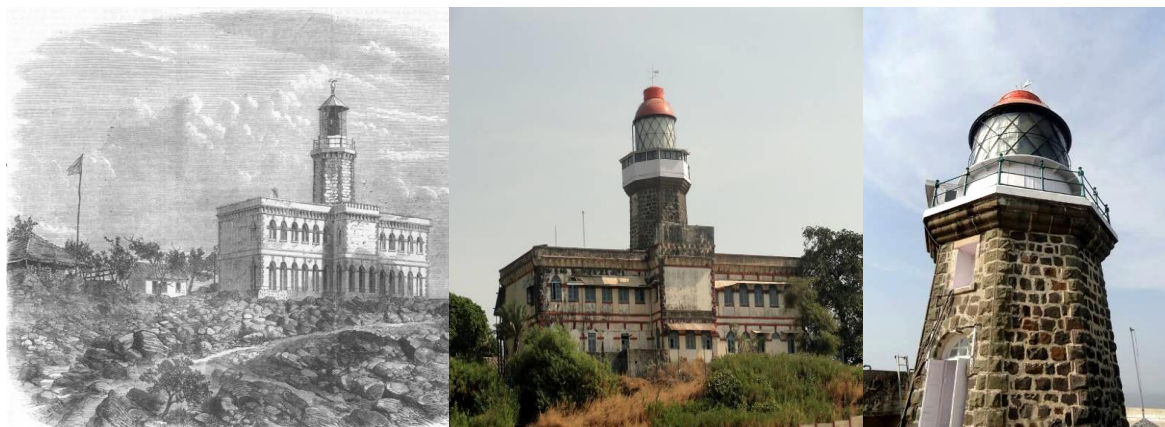
Kanhoji Angre Lighthouse (Kennery Lighthouse) in 1868 and at present

Kanhoji Angre Lighthouse located towards south of Mumbai coast marks the entry point to Mumbai harbor and acts as a prime aid to navigation for ships entering & leaving Mumbai. This lighthouse was established by the British in 1852.