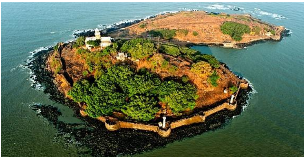
Aerial View of the Kanhoji Angre Lighthouse showing the Location of Lighthouse

The Lighthouse is located at the Kanhoji Angre Island on the top most point of the southern side hillock.